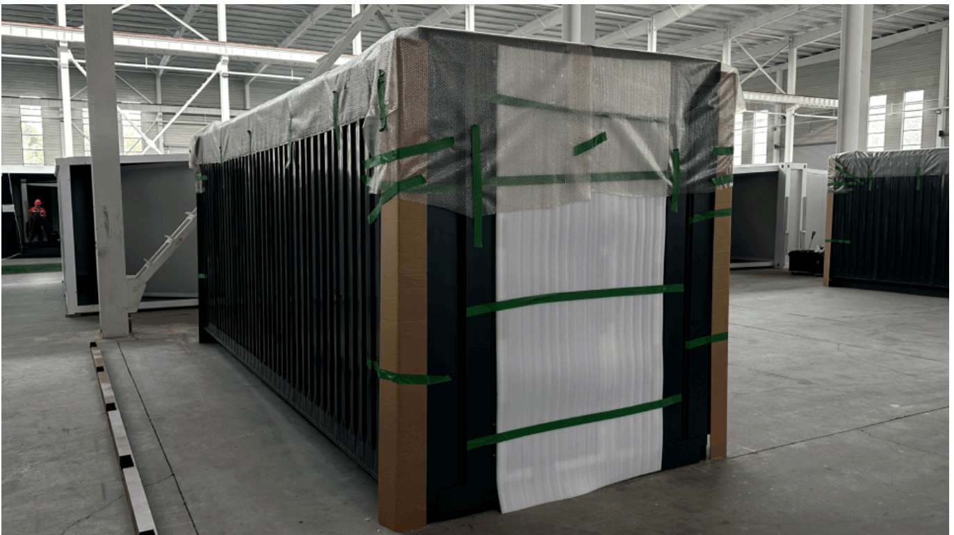
Prefabricated modular buildings and garages for rapid deployment