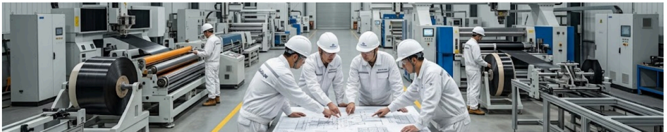
Automated Fiber Placement system with multi-tow head and laser-assisted heating for composite manufacturing

AFP (Automated Fiber Placement) is an advanced robotic manufacturing technology for precise deposition of multiple prepreg tow lanes onto complex contoured surfaces with high repeatability and accuracy. AFP systems are deployed across aerospace wing and fuselage panels, wind turbine blades, UAV airframes, high-pressure pipelines, and premium sporting goods. Metal-Asia.pw supplies fully configured AFP systems with integrated robotic platforms, laser or IR heating sources, control systems, and turnkey commissioning services worldwide as part of our Global Procurement Solutions with full Supply Chain Transparency .