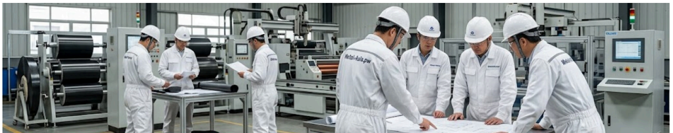
Automated Tape Placement system with laser heating for flat panel production

ATP (Automated Tape Placement) and LATW (Laser-Assisted Tape Winding) are complementary automated manufacturing technologies for composite components from wide prepreg tapes. ATP systems excel at laying flat and mildly contoured large-area panels (aerospace wing skins, fairings, nacelles), while LATW lines are purpose-built for winding tubes, cylinders, pressure vessels, and other axisymmetric parts. Metal-Asia.pw supplies both equipment types with full technical support, factory quality inspection, international logistics, and commissioning services worldwide through our Global Procurement Solutions platform.