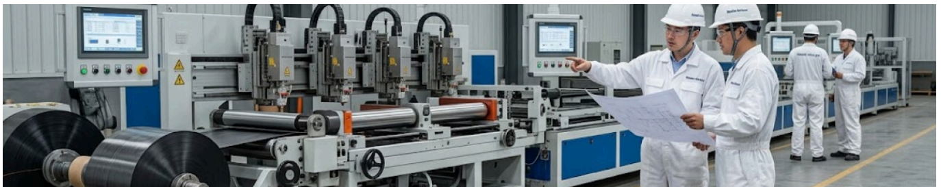
Robotic layup cell with 6-axis manipulator for automated composite fiber placement

Robotic Composite Layup Cells are integrated production systems built on industrial robot manipulator platforms with automated tape and fiber placement systems for manufacturing polymer composite components. These cells provide manufacturing flexibility, enabling processing of complex contoured parts with variable geometry without requiring dedicated fixed-purpose machinery. Metal-Asia.pw designs and delivers robotic layup cells tailored to your specific application requirements, with full project lifecycle support from audit through commissioning as part of our Global Procurement Solutions with Direct Factory Access and Complete Supply Chain Transparency .